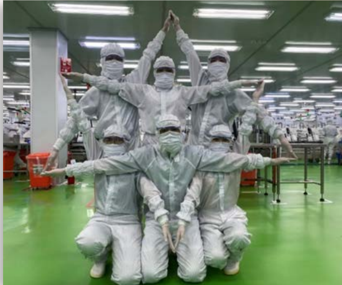
Associates show that collaboration can be creative and fun.

Innovation is the cornerstone of our success. We have come a long way on our journey to help save lives — from humble beginnings in a garage with a single product idea to our global presence and broad solutions portfolio today. We are ready to build relationships, deliver exceptional results, and continue creating products and services that help improve the lives of patients around the world.