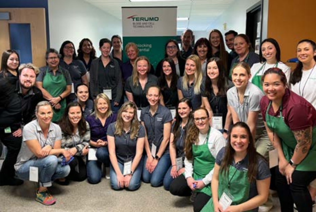
Employees volunteering at a GESTEM event put on by the Society of Women Engineers.