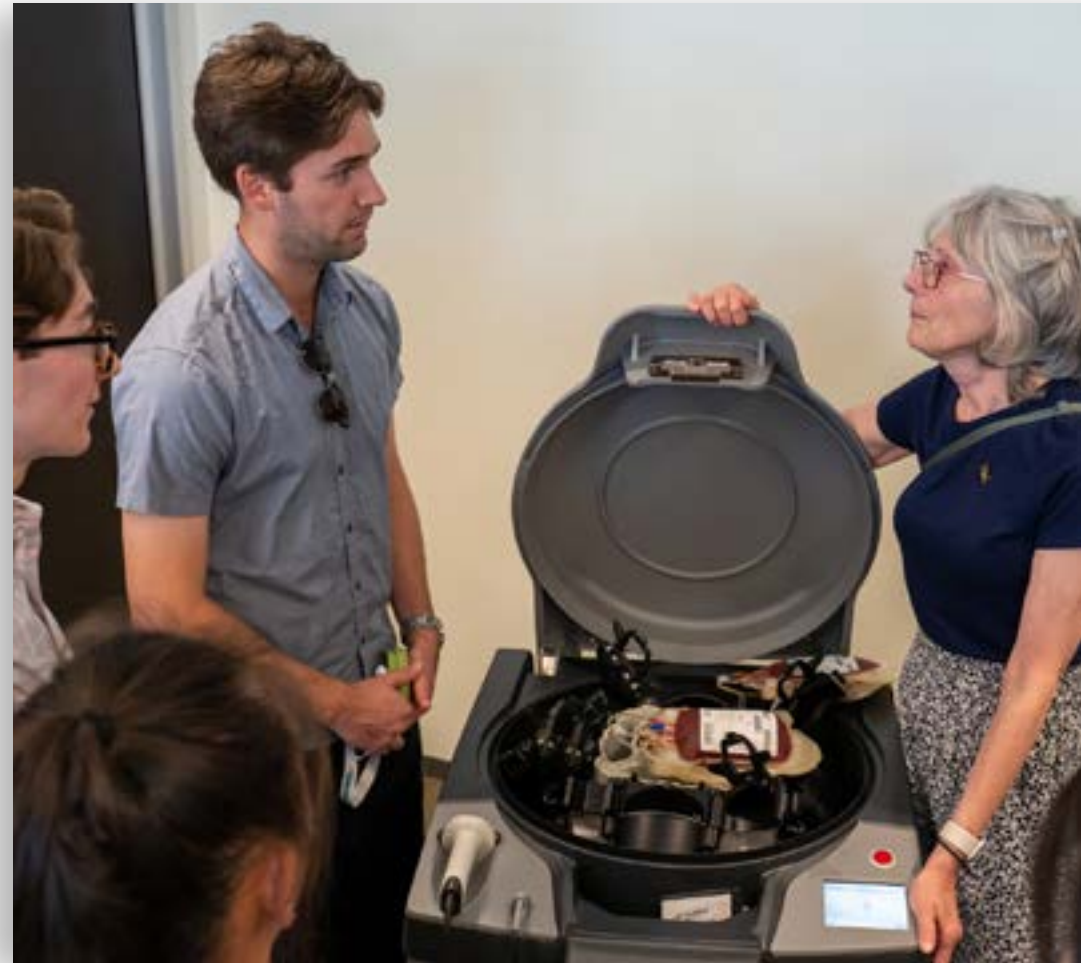
Education and training sessions help our associates grow and develop new skills.

We welcome new perspectives and ideas and value the uniqueness that every associate brings. We recognize that only when our associates are at their best can we serve our customers and patients by fulfilling our mission of Contributing to Society through Healthcare.