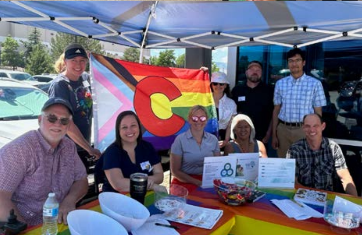
Celebrating PRIDE with a special event at our Littleton, Colorado facility.