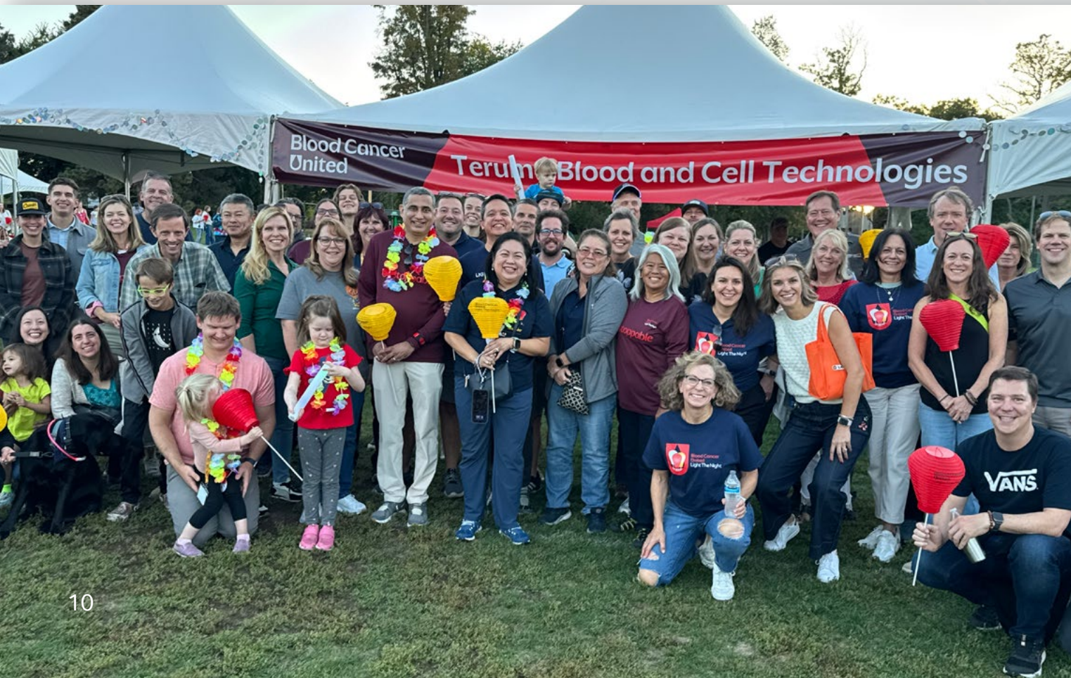
Light The Night

years we have hosted numerous fundraising efforts, including a silent auction, a golf tournament, a 5 km run, and a sponsored walk, with associates participating and volunteering at each event. We were thrilled to achieve our goal of raising $100,000 USD in FY24. In total, we have raised almost $2 million USD since 2014 to support Blood Cancer United's mission to cure blood cancer and improve the quality of life of all patients and their families.