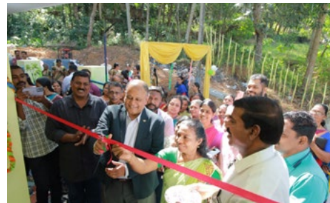
Ribbon cutting in India