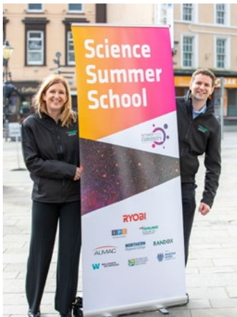
Supporting local schools in Larne, Northern Ireland

Associates have an active charity committee whose initiatives include participating in work experience weeks and hosting site visits for local schools, as well as supporting Women in Business, the Manufacturing Task Force, and the annual Brian Cox Science Summer School.