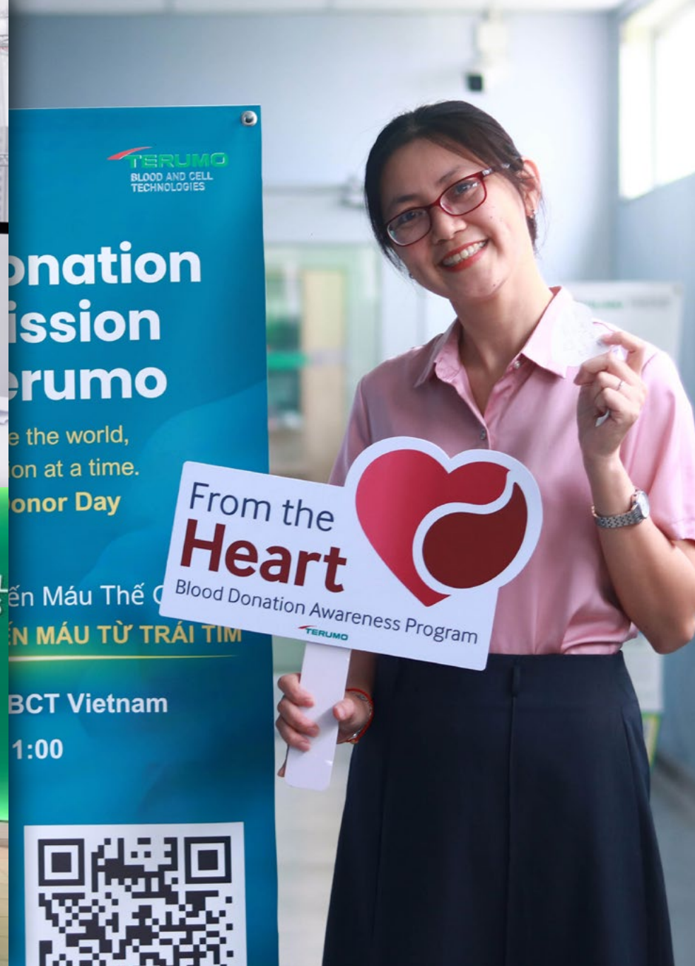
(Clockwise from top) World Blood Donor Day in Costa Rica, Vietnam, and the U.S.