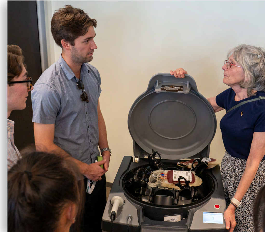
Education and training sessions help our associates grow and develop new skills.

We welcome new perspectives and ideas and value the uniqueness that every associate brings. We recognize that only when our associates are at their best can we serve our customers and patients by fulfilling our mission of Contributing to Society through Healthcare.