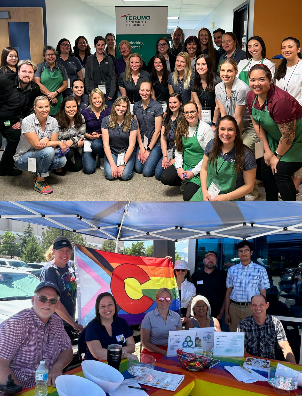
Employees volunteering at a GESTEM event put on by the Society of Women Engineers.