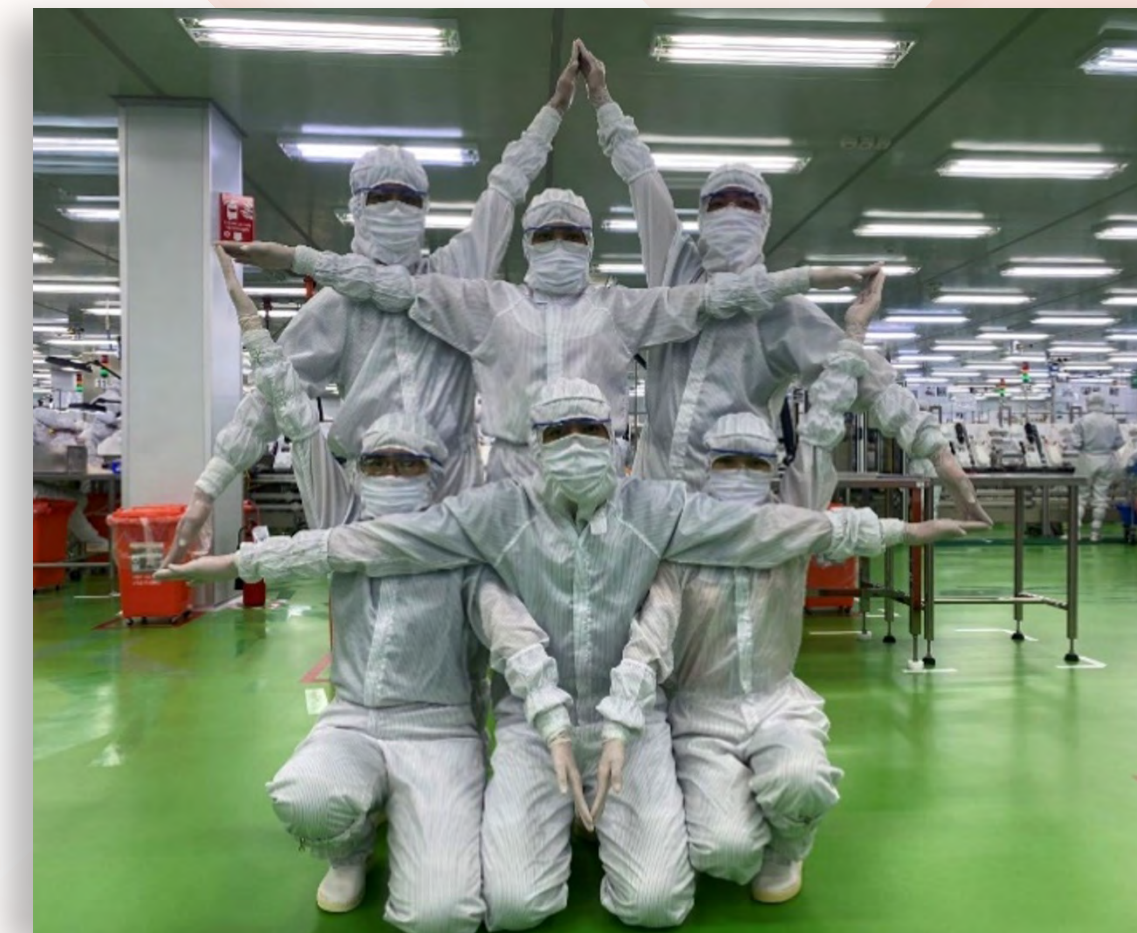
Associates show that collaboration can be creative and fun.

Innovation is the cornerstone of our success. We have come a long way on our journey to help save lives — from humble beginnings in a garage with a single product idea to our global presence and broad solutions portfolio today. We are ready to build relationships, deliver exceptional results, and continue creating products and services that help improve the lives of patients around the world.