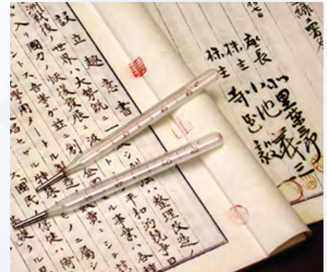
Terumo founders developed the first clinical thermometer in Japan