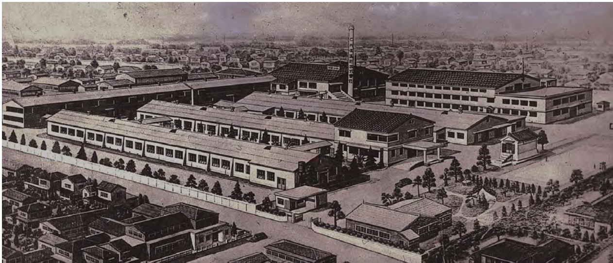
Terumo Corporation 1921

At Terumo Blood and Cell Technologies, we are proud to be part of this legacy and to align our company with Terumo Corporation's purpose, mission, and sustainability strategy . We build on this heritage with our promise of unlocking the potential of blood and cells, technology, and data to improve patient outcomes and serve unmet medical needs.